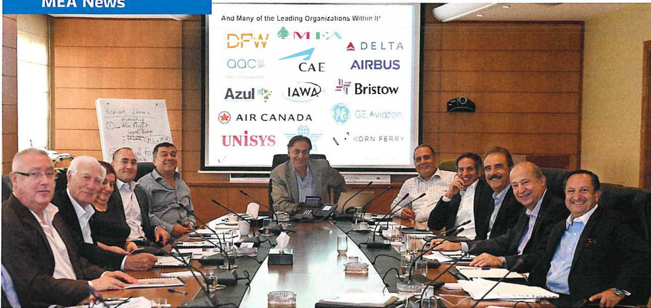
Cedar Routes members in a group photo